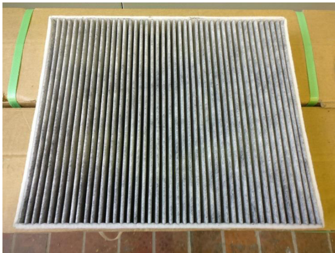
Figure 1: Upstream side of the test object

No information about filter area and material is available.