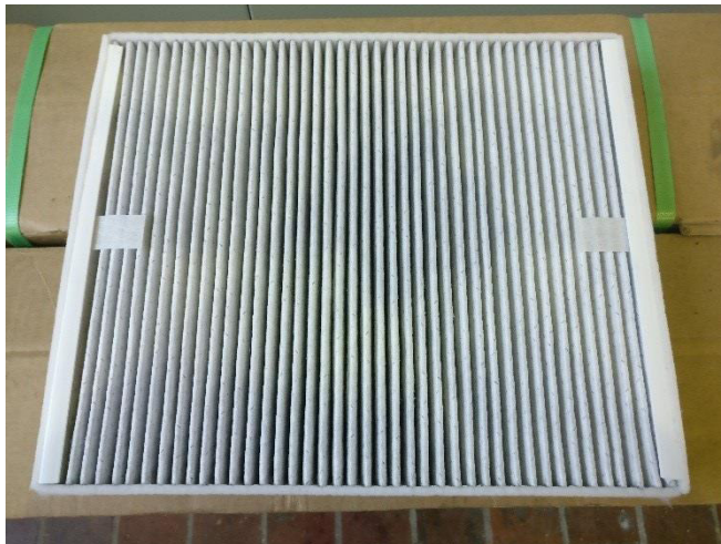
Figure 2: Downstream side of the test object